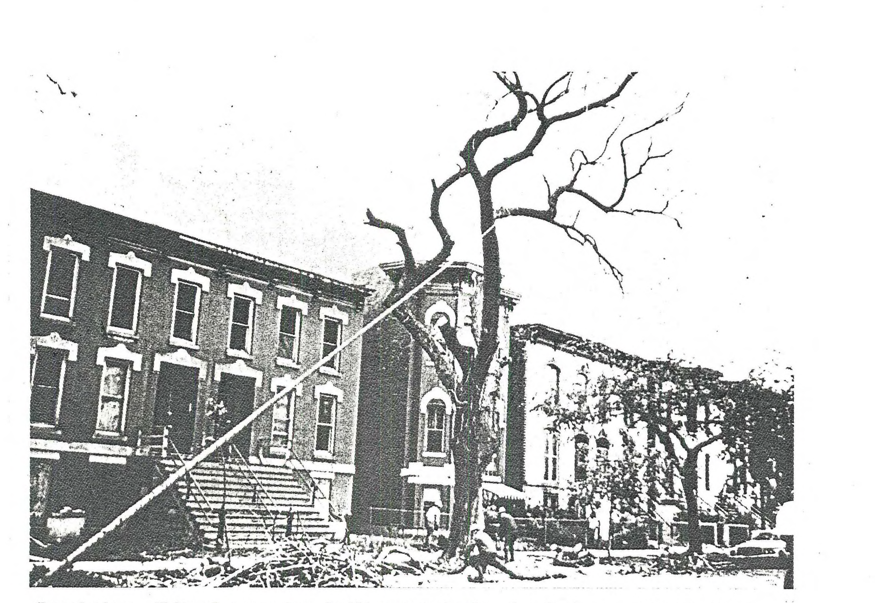
Frontispiece. White elms once were familiar trees in the urban landscape of eastern Canada. City elms can be better managed and protected with bylaws that require removal of dead trees and permit inspection of trees suspected of being diseased.