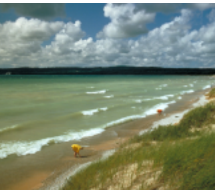
Lake Michigan beach, Petoskey, Michigan

The Agreement and its institutions are only as effective as the check and balance assurances that its obligations will be executed. As such, implementation of its goals and objectives must be dele-