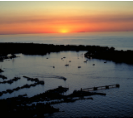
Sunset over Lake Erie Put-in-Bay Harbor, Ohio National Park Service, Perry's Victory and International Peace Memorial

This section provides an overview of major topics of concern related to the Agreement review and renegotiation. It also includes recommendations for responsive action to address specific conditions and practices that continue to drive degradation of water quality in the Great Lakes ecosystem. The discussion is structured under four major conceptual areas. Specific topics are numbered sequentially through the text. The four areas and specific topics are organized as follows.