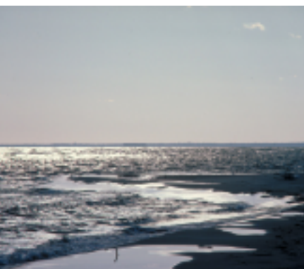
Silver water lapping at beach, Lake Michigan Tawas Pt. State Park, Michigan