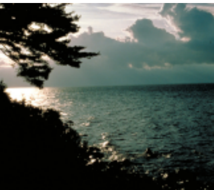
Chequamegon Bay, Lake Superior, Wisconsin

The IJC has no formal regulatory or enforcement powers under the Agreement, but it does have authority for oversight and monitoring progress toward achieving objectives by the United States and Canada. Both governments committed to the terms of the Agreement and accepted responsibility to honor it. The Parties (the governments) carry the responsibility for compliance. The relative roles and responsibilities of federal, state/provincial and local governments were left to each nation to determine, and this has been a significant factor in failures to achieve objectives, because