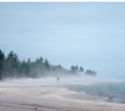
Sand blowing on beach near Oscoda, Lake Huron, Michigan