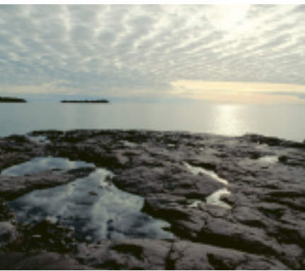
Lake Superior's North Shore, Lake Superior Minnesota

The Great Lakes Water Quality Agreement is renowned among worldwide international environmental legal experts as a model for how two or more countries can set goals together for the care of shared water bodies. As such, the Agreement has for decades provided a focal point for hope and advocacy by countless citizens who want to see the water resources of our region protected and restored. But the Agreement's proud history is not enough to guarantee an auspicious future. Just as the Great Lakes-St. Lawrence River ecosystem is beleaguered by water quality, invasive species, habitat, and other key threats, the Agreement itself is at risk from outdated goals and objectives, governments that dodge efforts to be held accountable for meeting even outdated goals and objectives, and a citizenry that is largely unaware of the moral power of this precedent-setting pact. With this report, leading voices from around the Basin are calling for the next generation of the Agreement to lead the way to revitalized health for the ecosystem and the people, fish, and wildlife that depend on it.